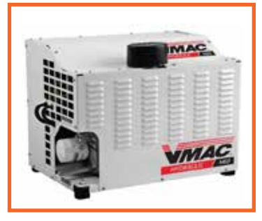
Hydraulic Air Options