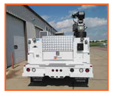
Lockable Deck Covers