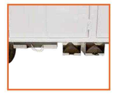
Wheel Chocks & Shoring Pads