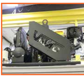
Engine Driven Air