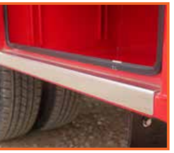
Stainless Steel Jamb Covers