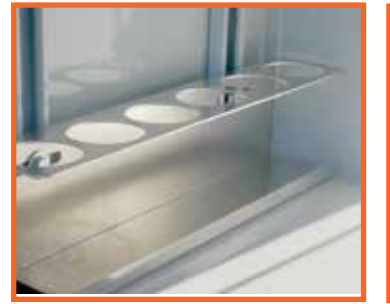
Aerosol Can Holders