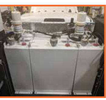
Integrated Lube Options