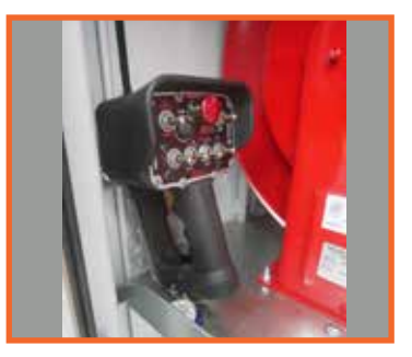
Crane Remote Saddle