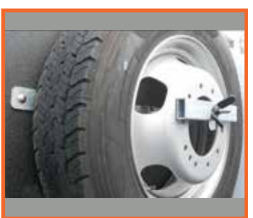
Spare Tire Bracket