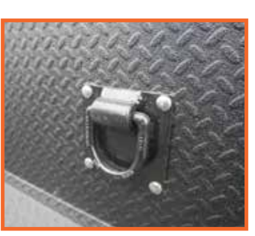
Weld-On D Ring