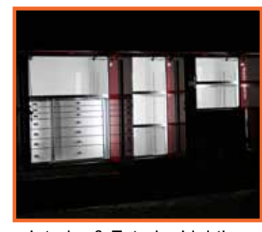
Interior & Exterior Lighting