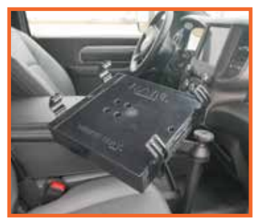
In-Cab Laptop Stand