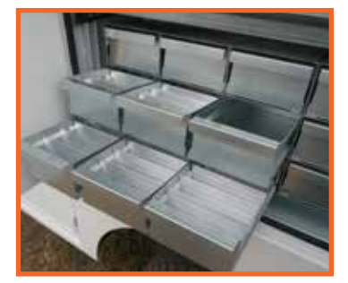
Roll-out Bolt Bins