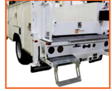
Folding Steps & Handrails